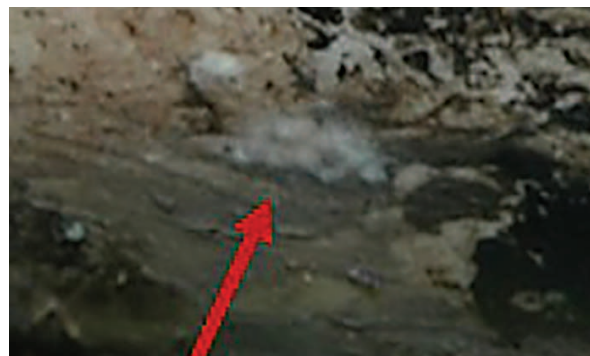
Above, Mucor hiemalis (arrow) growing on the abdomen of a human corpse.