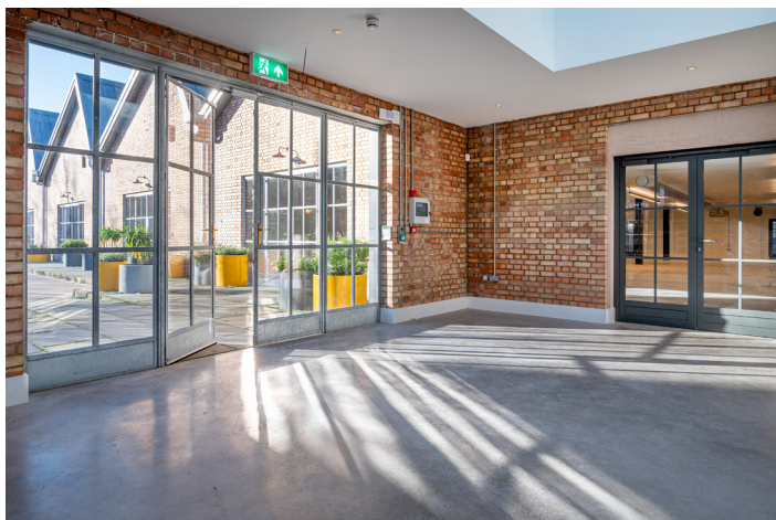
Above, the internal doors at Kew Studios are manufactured by Clement from thermally broken Jansen profiles

There is no doubt that the new steel windows and doors contributed to the overall energy efficiency of the project. For the exterior, Clement manufactured double glazed, steel frames from their W40 range. These double glazed, argon filled, low emissivity warm edge insulating glass units are ideal for heritage refurbishment projects where the pattern of the original fenestration is to be maintained. Instead of being painted, the frames were left with a contemporary Clement Naked Steel galvanised finish. The internal doors and screens were manufactured by Clement from slim Jansen Janisol 2 and C4 profiles which are thermally broken. They also meet the highest requirements for security and fire protection, while ensuring natural light flows throughout the space.