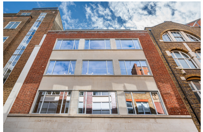
Above, the Jansen windows and doors by Clement at Little Portland Street improve thermal and air tightness at the building.

Clement manufactured bespoke steel windows and doors from the Jansen Janisol Arte 2 and Jansen Janisol HI ranges for the project. The new windows and doors contributed to the achievement of the project objectives.