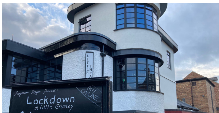
Above, Clement W20 bespoke steel windows at Gateshead's Little Theatre with advanced glass and insulation for great energy savings and better security

New steel windows from the Clement W20 range were chosen for this new space. The new metal frames were polyester powder painted in Jet Black (matt) and great care was taken choosing the glass for the two striking modular bays at the front of the building: SunGuard SuperNeutral 62/34 was chosen for the outer pane, offering very high light transmission while ensuring energy savings through solar protection and thermal insulation, krypton gas was used for the cavity and 4mm of toughened Planibel Grey was used for the inner pane.