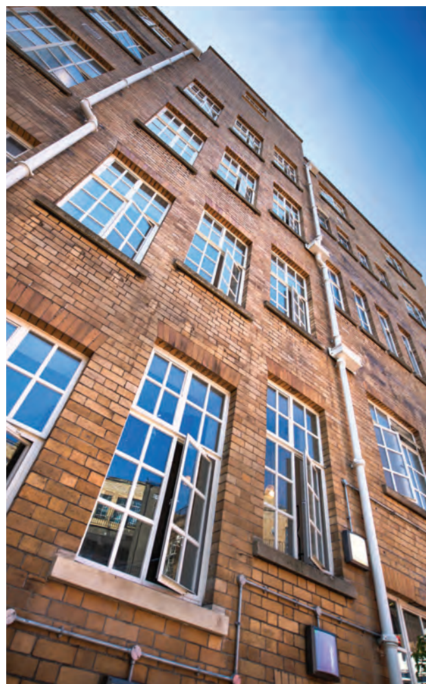
Above, The rear elevation boasts a huge display of new Clement steel windows, flooding the hostel with natural light.

Rob Yeandle of John Perkins Construction said: "The YMCA required a commercially viable 99 bed hostel where 10 per cent of the available beds could be given up to vulnerable young homeless people. The strong relationships built early on in the process with Clement Windows resulted in a conversion that embraced the history and heritage of the old building and blended new materials with old to create a stunning finished project."