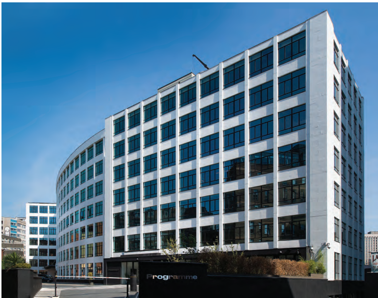
Above, Programme, formally known as The Pithay recently refurbished with 510 new Clement steel windows.

Not as old, but another prominent example of a Bristol building that has recently been revitalised is The Pithay, now known as Programme, which has been transformed into a stylish new hub for businesses looking for an inspiring place to work.